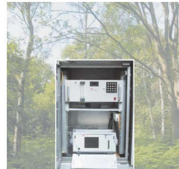
CPS12 CO 2 multi-point profiling system