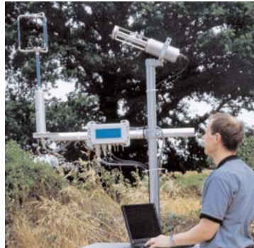
OPEC Open path eddy covariance system