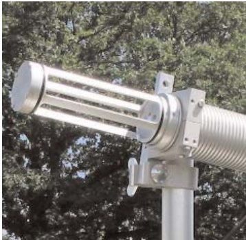
OP-2 Open path CO 2 / H 2 O analyser

A range of high performance gas exchange instrumentation for ecophysiological research applications